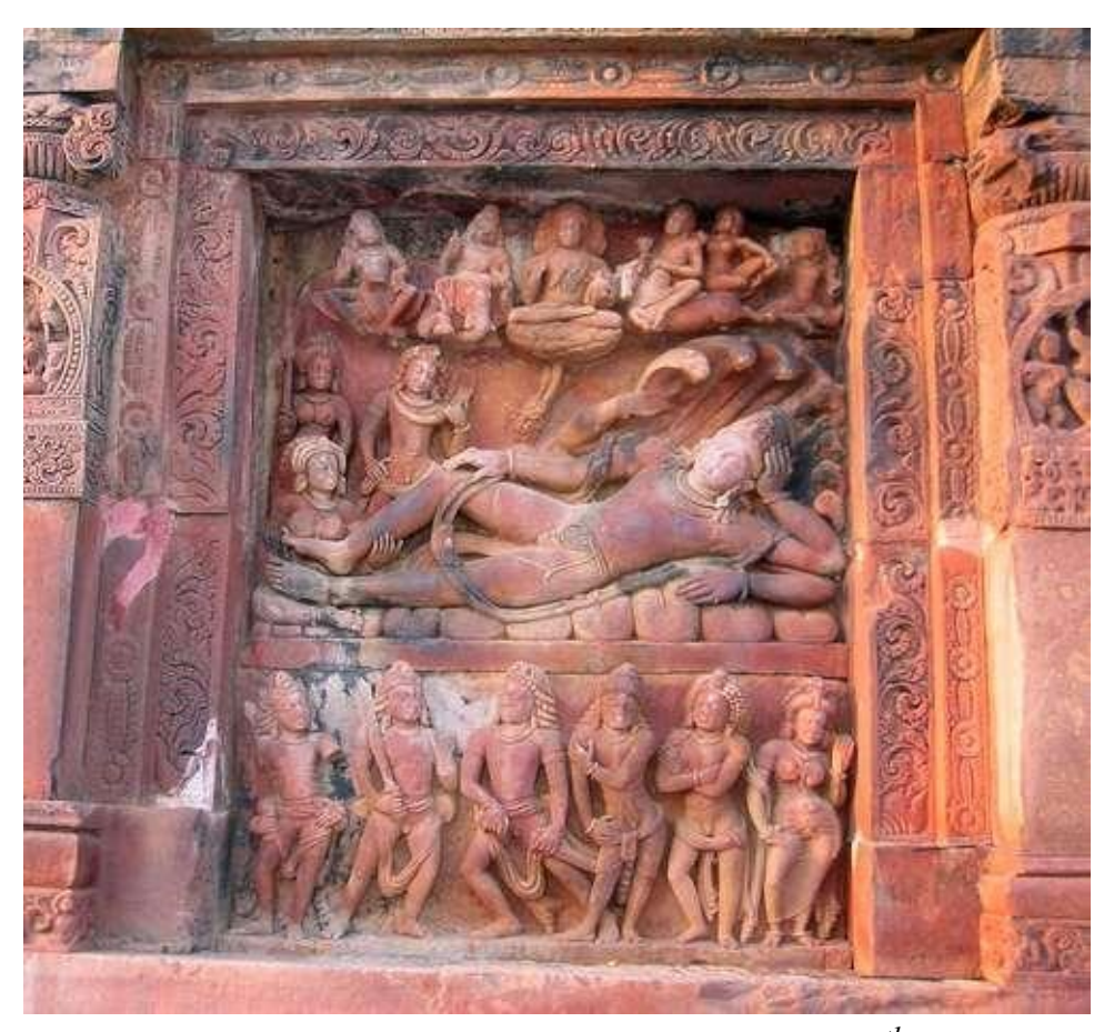
Figure 3: Sheshayi Vishnu from Deogarh, Uttar Pradesh, 5<sup>th</sup> century..

Zimmer establishes a link between them by conceiving the five Pandavas and Draupadi as celebrated recipients of Vishnu's favour (pg. 61). This implies an alternative reading of the sculpture in terms of polyandrous semantics. The Sheshayi Vishnu depicts one of the well-known polygamous representations wherein he is reclining on the serpent with Sridevi and Bhudevi attending to him. Such inter-textuality with the polygamous Vishnu with his two consorts and the polyandrous Draupadi with five husbands and the corresponding iconographic measurements and statures provides a striking contrast between the two systems depicted here. These two cases correspond to two of the three types of unions postulated by Marglin (1978: 298-315) wherein the power semantics between the male and the female representations/characters vary in each case. In the first, the God and his consort are in a power relationship: Vishnu-Lakshmi or Uma-Maheshwara in which the female is slightly smaller in size as compared to her male counterpart. Here the woman is primarily depicted as the consort of the god and it is only this that renders her deification. Most of the iconographies depicting such a relationship have the woman performing wifely duties or subservient duties. The Sheshashayi Vishnu is an exemplum of such a polygamous relationship. In the next type, the male and female counterparts are of equal power as in