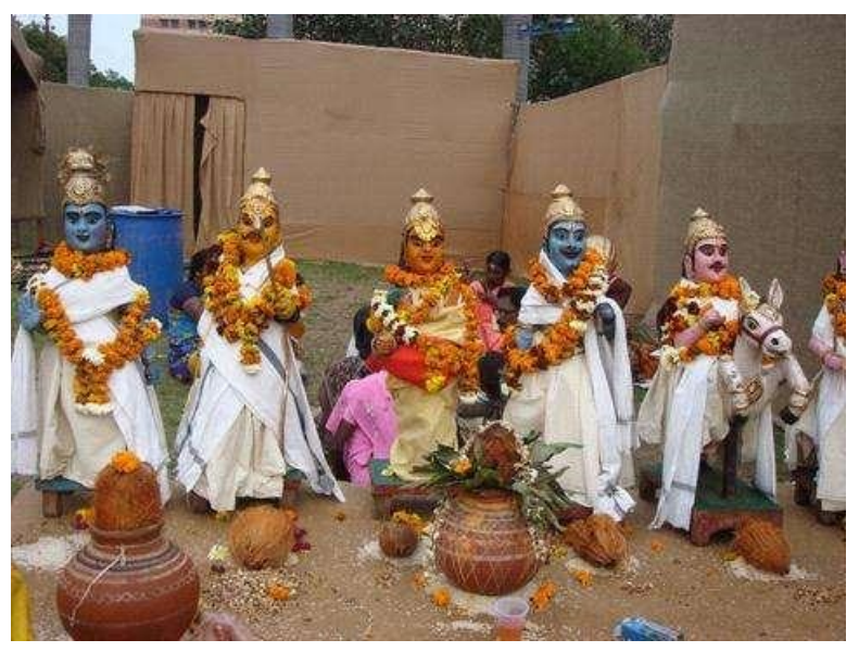
Figure 4: Draupadi and the Pandavas at the Draupadi Amman festival.

In order to substantiate the third type of Marglin, I would like to point out the prominence rendered to her in iconography represented through the process of deification in the region under discussion. In order to demonstrate this, I present a photo from the Draupadi Amman festival (Figure 4).